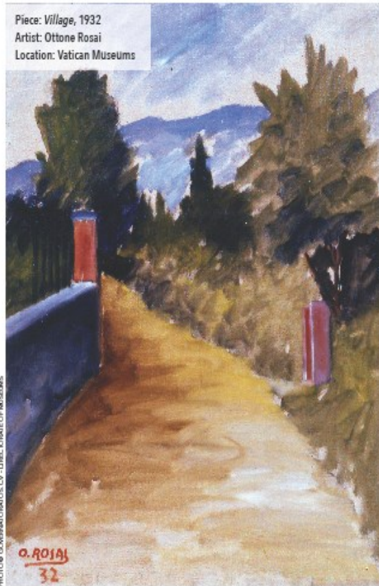
Piece: Village, 1932 Artist: Ottone Rosai Location: Vatican Museums