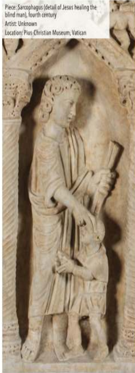
Piece: Sarcophagus (detail of Jesus healing the blind man), fourth century Artist: Unknown Location: Pius-Christian Museum, Vatican