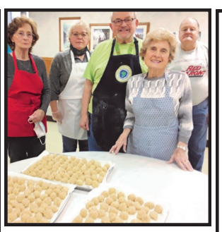
Lenten Pierogi making tradition for Easter continues

Are you doing your part on this Lenten Journey? Our Lenten food drive will conclude on Sunday, April 3rd. Non-perishable food items can be dropped off in Conlan Hall between the hours 8:30 am and Noon. Your support and generosity are greatly appreciated.